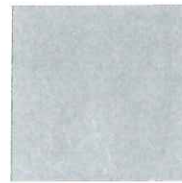
PMS Cool Gray 6